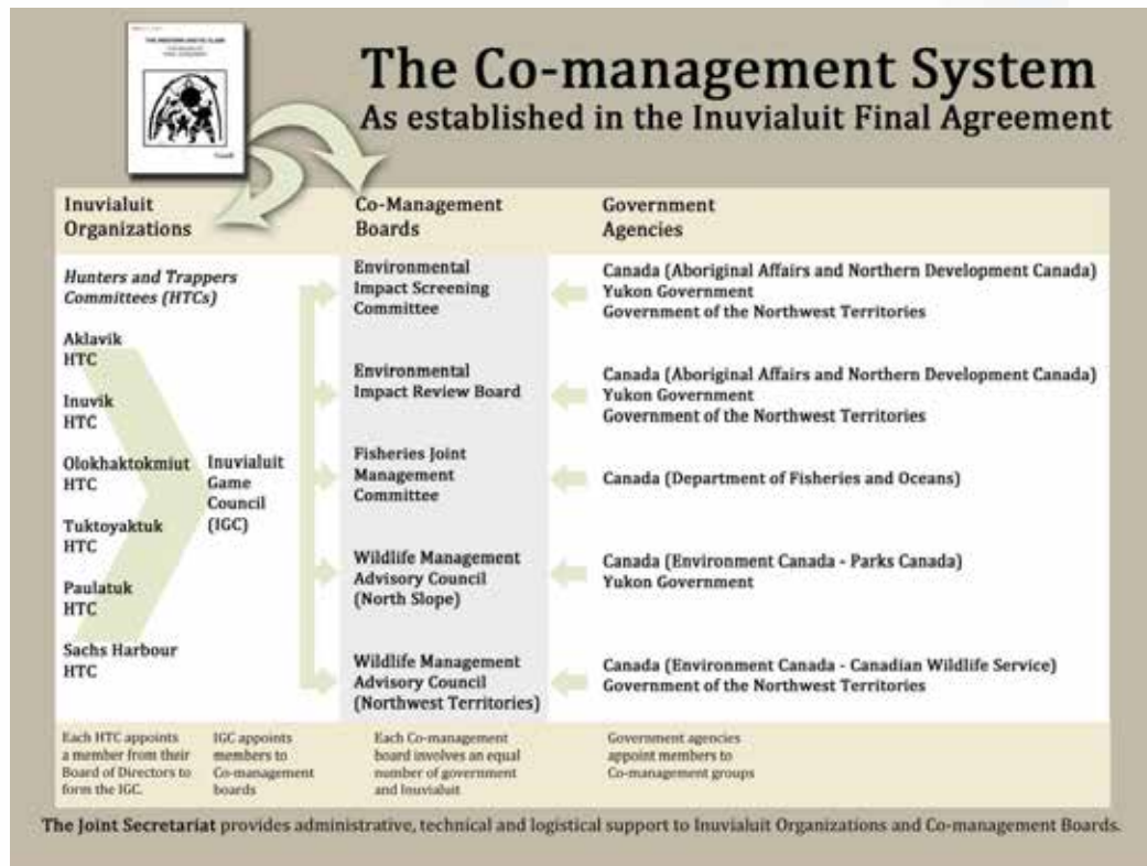
Figure 2 Chart showing the structure of different Implementing bodies, signatories, participating governments and Inuvialuit Organizations